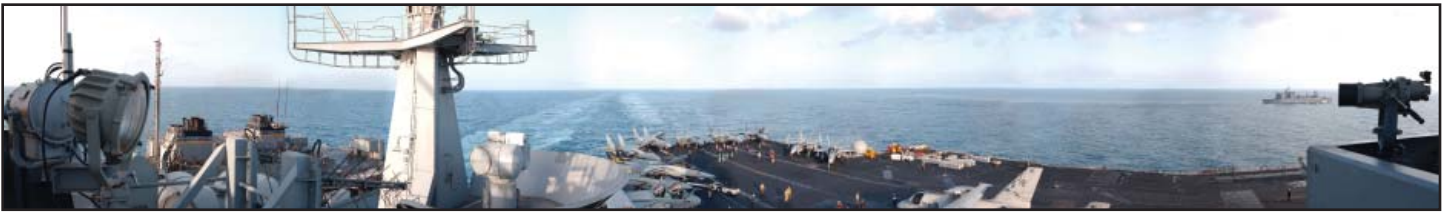
Panoramas (multiple shots stitched together)