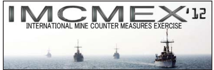
Graphics and logos (above and below)