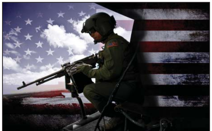
Superimposed images/changed backgrounds