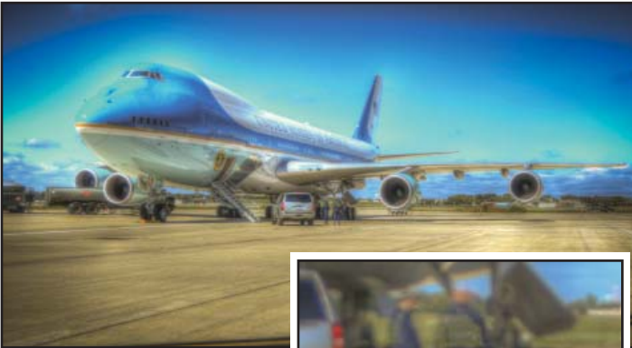
HDR or filtered images (detail shows "ghosting")