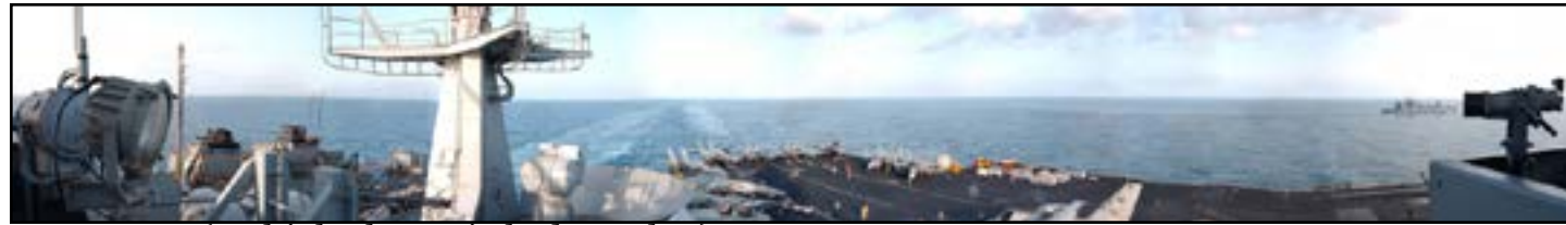
Panoramas (multiple shots stitched together)