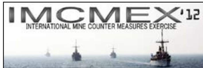
Graphics and logos (above and below)