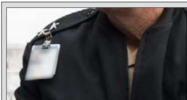
Photo security disclosure example (This photo has been altered for security purposes by blurring out identification badges.) Photo cropped to show detail.

Photo illustrations also include images that have been retouched, filtered or are manipulated in any other way. Images that are stitched together or contain cutouts, collages, panoramas, vignetting, multiple exposures (including High Dynamic Range techniques) or any added text or graphics are considered photo illustrations. The digital movement, addition or subtraction of