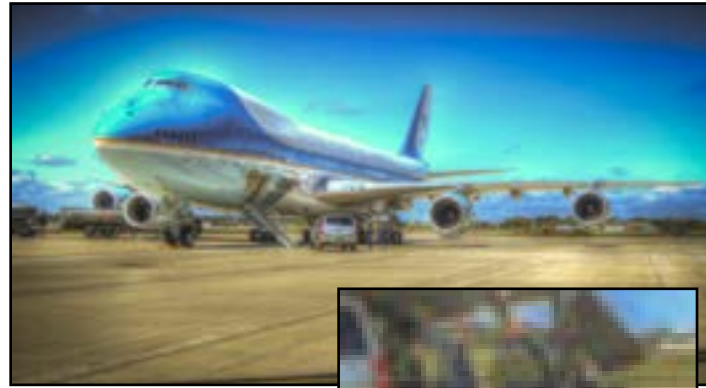
HDR or filtered images (detail shows "ghosting")