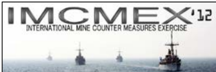
Graphics and logos (above and below)