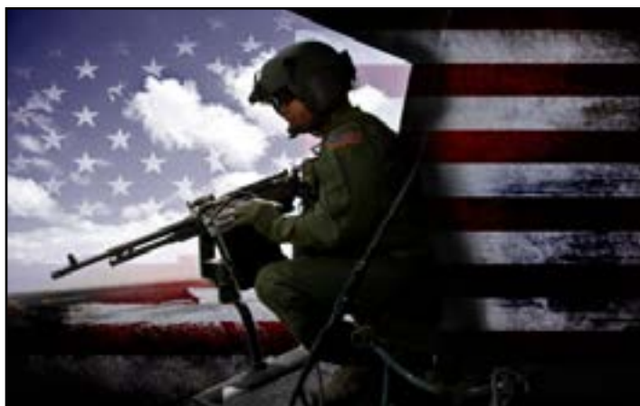
Superimposed images/changed backgrounds