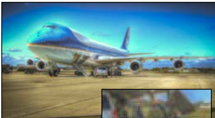
HDR or filtered images (detail shows "ghosting")