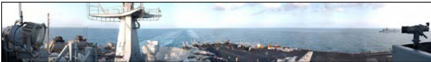
Panoramas (multiple shots stitched together)